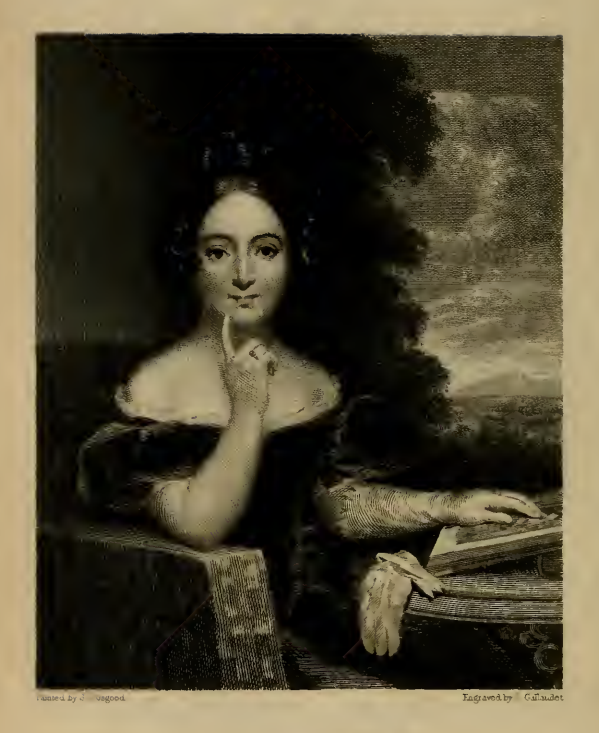
THE MEDICE OF YOUR.